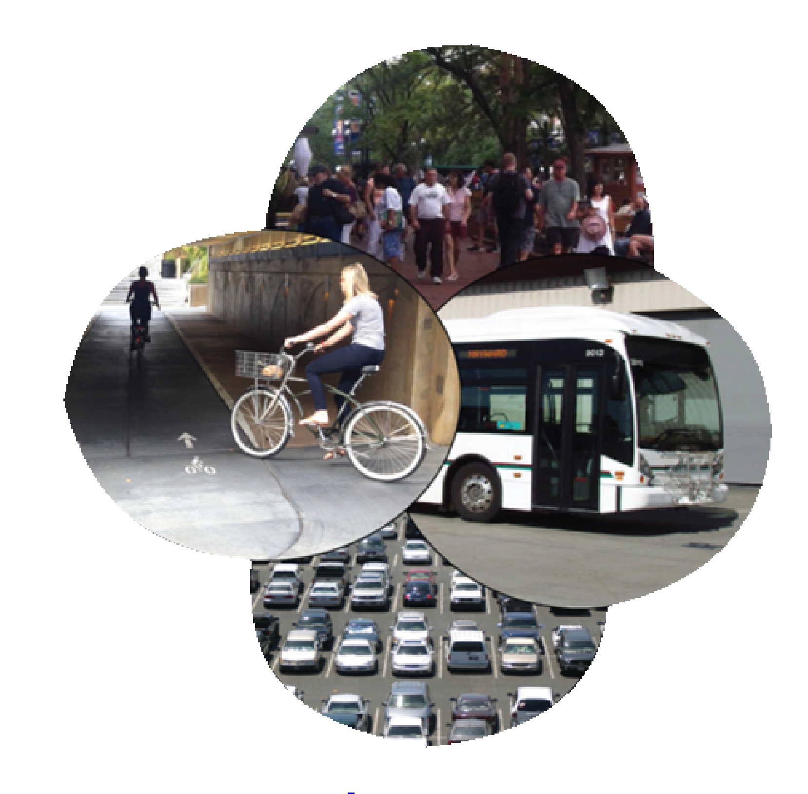
Complete streets accommodate all modes.

Complete streets are streets for everyone, no matter who they are or how they travel.